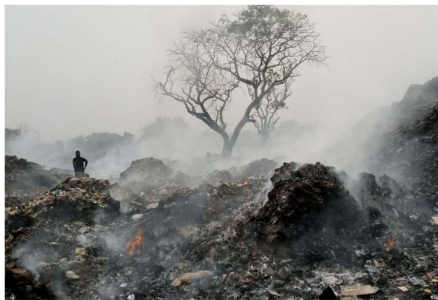
Fig. 2 Picture of the Sokoto-Aiyekale dump Site.

The indigenous area of town, known as the old residential area, is located in the central core area. The post-colonial area located around the city's core is the new residential area, whereas the government reserved area is the elevated neighbourhood area. Sobi Hill is an isolated hill in the city with an elevation of 394 m above sea level (ASL) in the north-western part and 200 m to 346 m in the east. Ilorin's drainage system has a dendritic pattern. 28 The wet season runs from March to October, and the dry season runs from November to February. The city's average annual rainfall is 1200 mm. 29 The government of Kwara State approved a bill in 2015 authorizing that all defunct landfilling locations within the city be demolished in order to make for growth and urbanization in the state, because it is an absolute mess for a state capital to have huge amounts of open refuse landfills on every accessible space on the road and street.