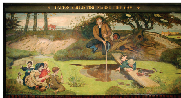
Fig. 2 "Dalton Collecting Marsh Fire Gas" is an 1887 mural by 1887 Ford Madox Brown in the Manchester Town Hall ( https://en.wikipedia.org/wiki/File:BrownManchesterMuralDalton.jpg ).

Atomism was a theme running through science from the late 16 th Century onwards. In his 1612 book, De Principiis atque Originibus , Francis Bacon (1561–1626) presents the case for atomism, although in subsequent work he preferred corpuscularianism. Similarly, Daniel Sennert (1572–1637) in his Hypomnemata Physica develops a model in which matter is composed of indivisible atoms although he also subscribed to the Aristotelian four elements—earth, air, fire, and water. Robert Boyle was a convinced atomist, but he also made important contributions to understanding what should be described as an element. He differed from Sennert in rejecting