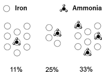
Fig. 2 Schematic presentation of ammonia coverage on Fe(110) surface.

step, \text{NH}_3 , \text{NH}_2 , and \text{NH} will release a hydrogen atom on the iron surface. The products of the \text{NH}_3 and hydrogen decomposition occupied different sites on the surface and consequently affected the surface coverage as shown in Table 4. When gas molecules interact with surfaces, they establish equilibrium with the surface products which is governed by the adsorption law, the reaction kinetics, and the partial pressure of the gas components. An increase in the gas partial pressure leads to an increase in the coverage of the adsorption products on the solid surface at a constant temperature. 31–33 Therefore, to understand the effect of \text{NH}_3 partial pressure, a higher \text{NH}_3 coverage (25%) on the Fe(110) surface as shown in Fig. 4 ( \text{NH}_3 decomposition on the iron surface at elevated coverage) was investigated. The summary of the activation energy barriers ( E_a ) of \text{NH}_3 decomposition in each step (initial geometry, transition geometry, and end geometry) is shown in Table 5. The E_a for the decomposition of \text{NH}_3 on the Fe(110) surface at 25% coverage is compared with that at 11% coverage. The first step of ammonia decomposition catalyzed by the Fe