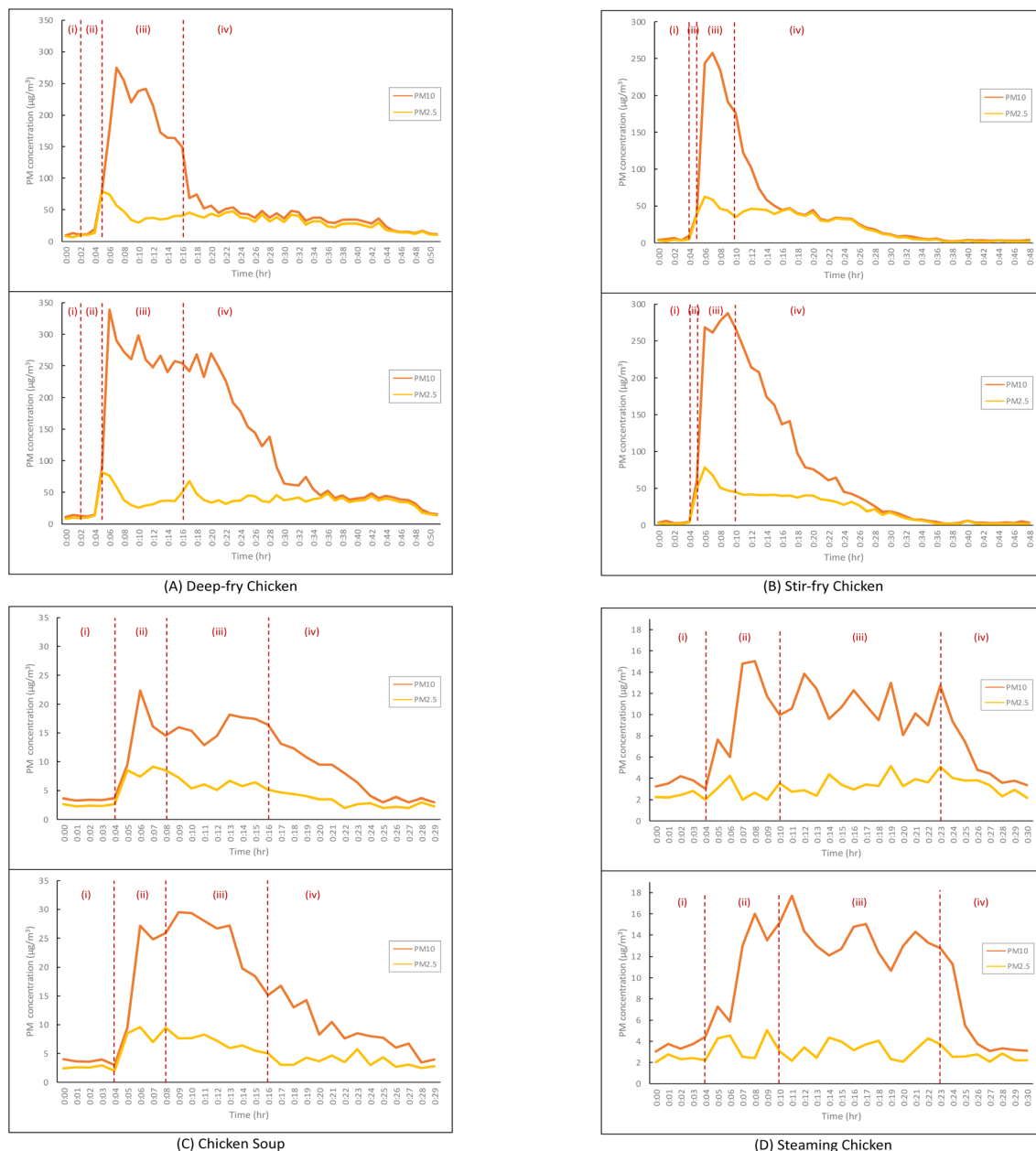
Fig. 2 Particulate matter emissions during the cooking process of four cooking episode. (A) Deep-fry chicken, (B) stir-fry chicken, (C) chicken soup and (D) steaming chicken, with extractors (upper image) on and (lower image) off. Four stages of cooking process: (i) the background level; (ii) heating of the pot or pan and the oil or water (iii) the main cooking processes; (iv) the post-cooking decay after the end of the entire cooking process.