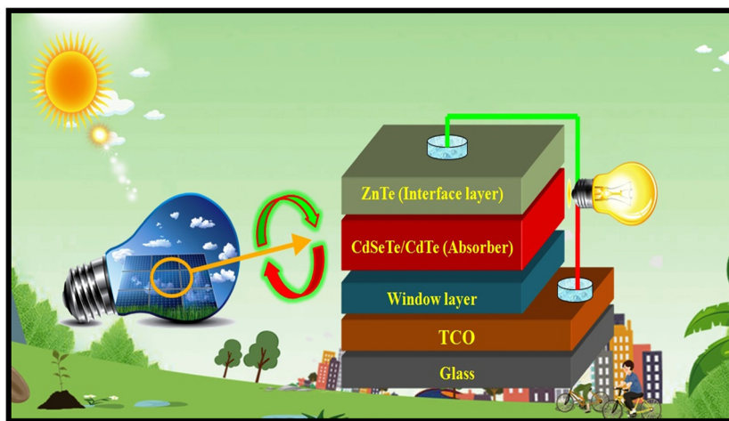
Fig. 13 Pictorial view of ZnTe back contact comprised of CdSeTe/CdTe thin film solar cell device structure together with natural conditions.

Although the CdTe semiconducting material is a promising absorber material for thin-film solar cell devices, the maximum achieved open circuit voltage ( V_{oc} ) for these devices is still lower than the theoretically predicated V_{oc} due to the barriers developed at the back contact. A simple CdTe device with the configuration of glass/FTO/CdS/CdTe/ZnTe:Cu/Au, as shown in Fig. 14, was developed with copper-doped ZnTe as the back