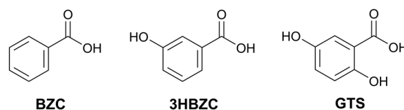
Fig. 1 2D chemical diagram for benzoic acid (BZC), 3-hydroxybenzoic acid (3HBZC), and gentisic acid (GTS).

Molecular conformation can affect calculations for CV and MC. The conformation of a co-former modifies the accessible surface area of the atoms available for the intra- and intermolecular interactions and, consequently, the coordination values are affected. Furthermore, the MC tool considers the length of the axes of the virtual box in which the molecule is contained. So, the shape of the molecule could affect this box size and, therefore, the results of the MC. Thus, it was necessary to obtain the most representative conformations for every co-former. All molecules were analysed by the CSD Conformer Generator tool. 22,23 For the rigid molecules, only one conformation was used. However, as the degree of conformational freedom for the co-formers increased, so did the number of molecular conformations