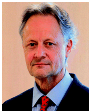
Paul D. Beer

While charge-neutral MIM-based receptors are increasingly finding applications in cation and anion recognition, their greatest advantage over charged receptors lies in their propensity to be utilised as heteroditopic receptors capable of simultaneously binding a cation and anion ion-pair. Ion-pair recognition has emerged as a powerful strategy to augment the binding properties of a receptor by exploiting favourable proximal cation–anion electrostatic interactions and, in some cases, conformational allosteric cooperativity associated with binding oppositely charged guests. 50 Indeed, studies conducted on acyclic/macrocyclic heteroditopic ion-pair receptors generally reveal improved binding affinities for ion-pairs or constituent ions relative to monotopic receptor analogues. 51 This has