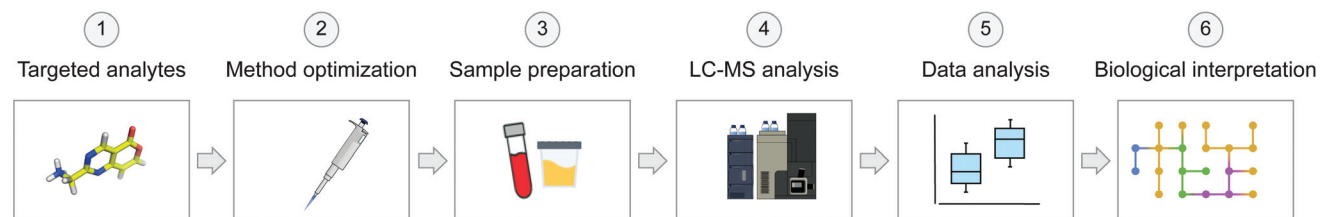
Fig. 2 Schematic representation of untargeted and targeted acquisition workflows in metabolomics studies. The untargeted acquisition workflow was reproduced from Pezzatti et al. 43 with permission from Elsevier, copyright [2019].