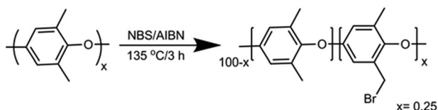
Scheme 1 Synthesis of partially brominated PPO (Br-PPO).