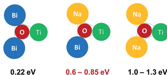
Fig. 3 Saddle-point configuration and associated activation energies for oxygen ion migration in NBT. Values taken from ref. 37.

Partial replacement of \text{Na}^+ by \text{K}^+ significantly decreases the bulk conductivity, which is surprising as \text{K}^+ has higher