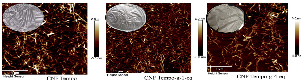
Fig. 5 AFM pictures of CNF Tempo, CNF Tempo-g-1-eq. and CNF Tempo-g-4eq. with films after grafting on the surface of cellulose (conc. 0.1%, tapping mode in air, area 3.3 \times 3.3 \mu\text{m}^2 ).

Degradation of TEMPO cellulose fibers starts at 200 °C under nitrogen while with the conventional cellulose, its decomposition start at 300 °C. The initial decreases in weight observed at about 60–100 °C in the reference TEMPO CNF is a consequence of the loss of the residual moisture. But, this depression in weight for residual moisture is slightly lower in the grafted samples stating the presence of less moisture comparatively after grafting which is classical for all grafting procedures. 52 As already shown in previous literature, small modification might prove indirectly the grafting. Indeed it is well-known that nanocellulose grafting with large molecule like