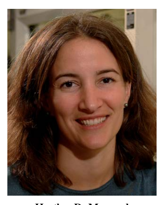
Heather D. Maynard

Initially, PEG was synthesized by reacting mPEG (monomethoxy-PEG) of molecular weight (M_w) 5000 with cyanuric chloride, forming PEG dichlorotriazine. In this approach, one of the two remaining chlorines on PEG dichlorotriazine is displaced by nucleophilic amino acid units such as lysine, serine, tyrosine,