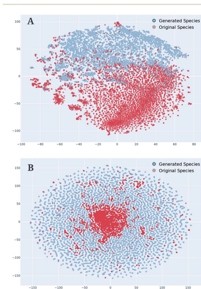
Fig. 5 t-SNE plot of the training dataset and the generated dataset with the oscillator strength representative of the size of the points. Subfigure A has all of the 8000 original species and a randomly sampled 8000 generated species. Subfigure B has all of the 8000 original species and 80 000 randomly sampled generated species.

In this study, the AGoRaS network 7 was extended from the generation of gas-phase chemical reactions to the generation of quantum materials. This study was designed to demonstrate how an AGoRaS-Quantum VAE could be used in other applications of nanoscale materials science. The primary purpose