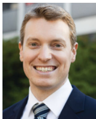
Zachary M. Hudson

† Electronic Supplementary Information (ESI) available: A synthetic scheme towards aryl tetrazoles; ^1\text{H} and ^{13}\text{C}\{^1\text{H}\} NMR spectra, solvatochromic and AIE properties, nanosecond PL decay curves, cyclic voltammetry data, Tauc plots, time-resolved emission spectra and computational results for TTTD-3HMAT , TTTD-3tBu , TTTD-3ACR . See DOI: https://doi.org/10.1039/d2tc01153k