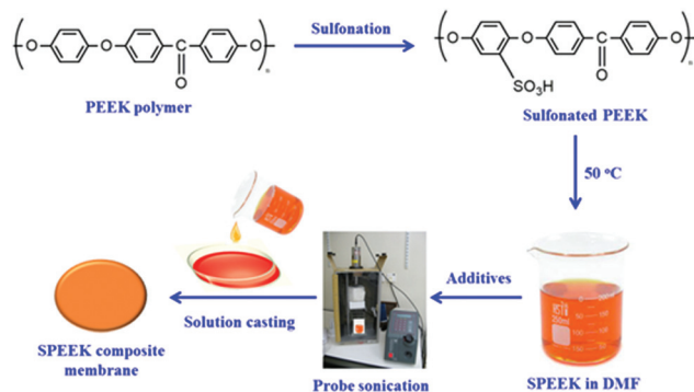
Fig. 5 Schematic preparation of SPEEK membranes.

Poly(ether ether ketone) is a thermally stable, chemically resistant, and mechanically stable material. However, it cannot be directly used in fuel cell applications because of its fully hydrophobic segments. Hence, introducing the sulfonic acid group into PEEK polymer enhances the hydrophilicity, solubility in polar solvents, ion exchange capacity, and transport number. The solubility of the SPEEK membrane is reported as follows; (i) if the degree of sulfonation (DS) is around 30%, then it is soluble in DMF, DMAc, DMSO, and NMP under hot conditions only (ii) if the DS is around 40–70%, it is soluble in DMF, DMAc, DMSO, and NMP at room temperature (iii) if the DS is above 70%, it is soluble in methanol, and (iv) if the DS is 100%, it is soluble in hot water. 41