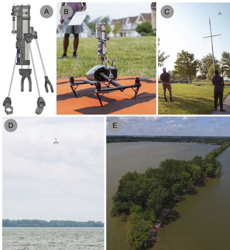
Fig. 1 (A) Engineering model of the AirDROPS package. (B) The AirDROPS attached to the DJI Inspire 2 platform. (C) Intercomparison flight of the AirDROPS adjacent to the sonic anemometer mounted on the flagpole. (D) Sampling mission at GLMS, 10 m above the surface of the water. (E) Drone image and aerial view of the sampling location at LE to the right of the point in the image.

disinfection using ethanol. The impinger was based on a design previously described by Powers et al. , 2018 21 adapted for use with a 15 mL polypropylene sterile conical centrifuge tube (CLS430791, Corning, Millipore Sigma). An aliquot of 2.5 mL of sterile water was added to the 15 mL conical tube immediately prior to each sampling mission. Two micro vacuum pumps (PN: SC3101PM, 21 Hualun Sci & Tech Pk 1st Ind Zn Fenghuang Village, Fuyong Town, Shenzhen, Guangdong, China) were used in parallel to supply a flow rate of 0.6 \text{ L min}^{-1} to the impinger. This flow rate was determined using an FTS Flow Calibrator from ARA Instruments (Eugene, OR, USA), and was optimized to ensure that the impinging fluid was not evacuated from the tube during the sampling mission ( i.e. , higher flow rates caused water to escape the tube into the vacuum pump). The collection efficiency of the impinger has been reported previously by Powers et al. 21 to be 75% for 1 \mu\text{m} polystyrene latex beads and 99% for 3 \mu\text{m} polystyrene latex beads. The inlet to the impinger was located 330 mm above the horizontal plane of the drone propellers to limit fouling of the sensor due to propwash (Fig. 1B). An optical particle counter (PMS7003, Plantower,