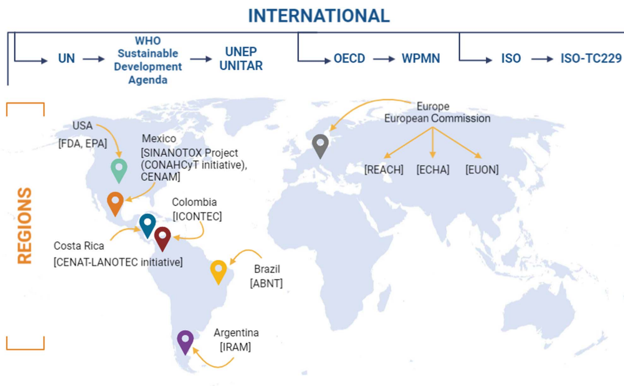
Fig. 4 National and international authorities, agencies and initiatives developing frameworks, legislations, and guidelines for nanomaterials. UN, United Nations; WHO, World Health Organisation; UNEP, United Nations Environment Program; UNITAR, United Nations Institute for Training and Research; OECD, Organisation for Economic Cooperation and Development; WPMN, Working Party on Manufactured Nanomaterials; ISO, International Organisation for Standardisation; ISO-TC229, International Organisation for Standardisation Technical Committee 229; USA, United States of America; FDA, Food and Drug Administration; EPA, Environmental Protection Agency; SINANOTOX, National Nanotoxicological Evaluation System Initiative; CONAHCyT, National Council of Humanities, Sciences and Technologies; CENAM, National Centre of Metrology; CENAT, National Centre of High Technology; LANOTEC, National Laboratory of Nanotechnology; ICONTEC, Colombian Institute of Technical Norms; ABNT, Brazilian Association of Technical Norms; IRAM, Argentinian Institute of Normalisation and Certification; REACH, Registration, Evaluation, Authorisation, and Restriction Chemicals; ECHA, European Chemical Agency; EUON, European Union Observatory for Nanomaterials. Original creation (using Excel and Biorender programs) based on information obtained from ref. 12, 31, 79–81, 94, 98, 115, 124–137, 143, 144, 159, 180, 189, 202–204, 269.

The momentum of nanotechnology development, establishment, and consolidation paths varies and differs between