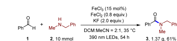
Scheme 2 Gram-scale reaction.

Reaction conditions: aldehyde (0.6 mmol), amine (0.2 mmol), FeCl 3 (15 mol%), KF (2.0 equiv.), FeCl 2 (1.0 equiv.) in DCM:MeCN = 2 : 1, 10 W 390 nm LEDs at room temperature for 12 hours. Yields of isolated product.