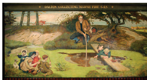
Fig. 2 "Dalton Collecting Marsh Fire Gas" is an 1887 mural by 1887 Ford Madox Brown in the Manchester Town Hall ( https://en.wikipedia.org/wiki/File:BrownManchesterMuralDalton.jpg ).

Atomism was a theme running through science from the late 16 th Century onwards. In his 1612 book, De Principiis atque Originibus , Francis Bacon (1561–1626) presents the case for atomism, although in subsequent work he preferred corpuscularianism. Similarly, Daniel Sennert (1572–1637) in his Hypomnemata Physica develops a model in which matter is composed of indivisible atoms although he also subscribed to the Aristotelian four elements—earth, air, fire, and water. Robert Boyle was a convinced atomist, but he also made important contributions to understanding what should be described as an element. He differed from Sennert in rejecting