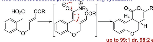
Fig. 1 Summary of ammonium enolate promoted intramolecular catalytic enantioselective carbo- and heterocycle formation.

Initial model studies probed the cyclization of enone acid 1 to chromenone 2, with 1 readily prepared in three steps from 2-hydroxyphenylacetic acid. 12 Treatment of 1 with pivaloyl chloride and i -Pr 2 NEt gave the corresponding mixed anhydride in situ , which was subsequently treated with isothiurea catalysts 3 to 6 and evaluated for the proposed cyclization (Table 1, entries 1–4). Achiral DHPB 13 gave the desired cis -chromenone 2 in 85% yield and > 99 : 1 dr. Screening of a small range of chiral isothiureas 4–6 indicated the use of tetramisole 4 and its benzannulated counterpart, BTM 5, showed promising enantioselectivity (~ 87 : 13 er, entries 2 and 3). Subsequent optimization through variation of solvent, temperature and base 12 showed that performing the reaction at 0 °C in CHCl 3 with excess i -Pr 2 NEt (1.5 equiv. for mixed anhydride formation, followed by an additional 2.5 equiv.) gave highest observed dr and er (entries 6–9). Lowering the catalyst loading to 5 mol% using tetramisole 4 gave 2 in 85% yield, > 99 : 1 dr and 93 : 7 er, with BTM 5 giving lower