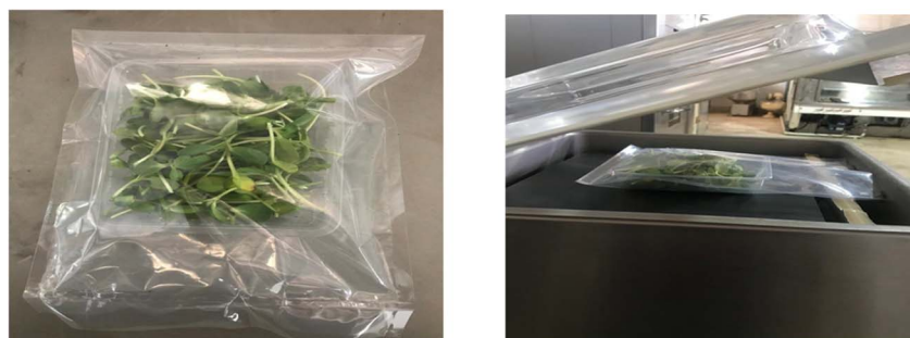
Fig. 1 Packaged sunflower microgreen samples using the MAP device

2.3.5. Phenolic compounds. The total phenolic contents of the extract were measured using the Folin–Ciocalteu method. A 100 µL aliquot of the methanol-diluted extract (1 : 10 v/v) was mixed with 6 mL of distilled water, followed by the addition of 500 µL of Folin–Ciocalteu reagent. After 8 min, 5.1 mL of sodium carbonate solution (20% w/v) were added, and the mixture was kept at room temperature for 30 min to complete the reaction. Then, its absorption at 765 nm was read using a spectrophotometer (Shimadzu UV-VIS 1601, Japan). The amount of total phenolic compounds present in the sample was determined from the standard curve (gallic acid in