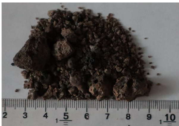
Fig. 2 BFS used in this research study.

Blaine fineness (NMX-C-056-ONNCCE-1997). The chemical composition of the BFS was determined by X-ray fluorescence (XRF) using a Rigaku Primus II analyzer (equipped with a rhodium tube and 125 \mu\text{m} beryllium window). The BFS was characterized by X-ray diffraction (XRD) using an Empyrean Malvern Panalytical diffractometer (nickel filter, Cu K \alpha radiation with \lambda = 1.5406 \text{ \AA} , PIXcel3D detector, 5 kV and 40 mA, step size of 0.002^\circ , and an integration time of 50 s per step). The morphology of the BFS particles was observed by scanning electron microscopy (SEM) using a Philips XL20 microscope with a 25 kV backscattered electron (BSE) detector and a working distance of 4 mm.