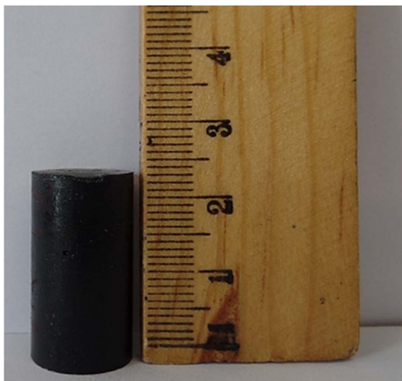
Fig. 3 Specimen used for the compressive strength test.

into cylindrical plastic molds with a height to diameter ratio of 2 ( \Phi 13 mm, h = 26 mm), and were vibrated for 10 min in a vortex (Glas-Col Multi-Pulse Vortex). Subsequently, the specimens obtained (Fig. 3) were cured for 7 and 28 days at constant temperature ( 22 \pm 2 °C) and relative humidity ( 98 \pm 3\% ) in a conventional curing chamber. Compressive strength tests were performed in triplicate according to ASTM C39 on a universal MTS 20T machine with a preload of 3 kg and a displacement load at a constant rate of 5 \text{ mm min}^{-1} . The compressive strength of the AAMs was expressed as the average value of the three measurements after 7 and 28 days of curing (most common normative and informative ages). After testing, the resulting fragments were washed with 80 mL of an acetone/ethanol mixture (1 : 1 by volume) and dried at 120 °C for 24 h to stop hydration/activation reactions. 47 Finally, the fragments were placed in a desiccator under vacuum until the CO 2 capture capacity was evaluated and microstructural characterization was conducted.