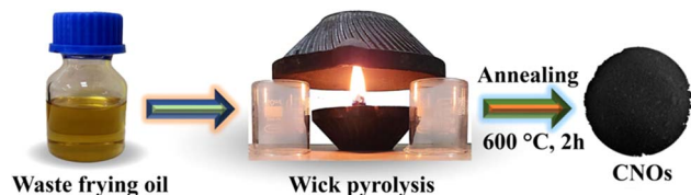
Fig. 6 A schematic illustration for the synthesis of CNOs by the flame pyrolysis method. 77

generated using a current of 110 A in a helium atmosphere at a pressure of 450 torr, with a 15 mm distance between the two electrodes. In another experiment, CNO composites synthesized using this method exhibited a higher heterogeneous electron transfer (HET) rate compared to hollow CNOs. They also demonstrated superior performance in applications such as supercapacitors and batteries. 69,70