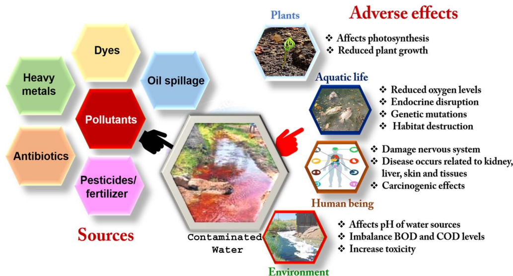
Fig. 1 Sources of wastewater and their adverse effects. 12

covered by water, only about 3% exists as freshwater, most of which is locked in ice and glaciers, leaving a small fraction available in liquid form in lakes, rivers, and groundwater. 3 This limited supply is increasingly threatened by a growing array of contaminants entering aquatic systems from multiple sources (Fig. 1). A major contributor to this crisis is the proliferation of emerging organic contaminants (EOCs), a diverse group of both well-known and newly developed chemicals with significant ecological and human health risks. These include pharmaceuticals, personal care products, pesticides, veterinary drugs, industrial byproducts, food additives, and engineered nanomaterials, hundreds of which have been detected globally in water bodies. 5,6 Their sources are varied, ranging from inadequately equipped WWTPs and hospital effluents to livestock waste, septic systems, and industrial discharges. Conventional treatment technologies often fail to effectively remove these persistent pollutants, allowing them to accumulate and exert long-term environmental impacts. 7,8