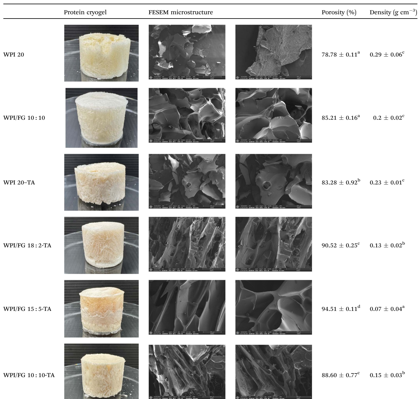
Table 2 Macroscopic appearance, scanning electron microscopy (SEM) micrographs, porosity (%), and density ( \text{g cm}^{-3} ) of protein cryogel formulations: WPI 20, WPI/FG 10 : 10, WPI 20-TA, WPI/FG 18 : 2-TA, WPI/FG 15 : 5-TA, and WPI/FG 10 : 10-TA a

a Different superscript letters in the same column indicate significant differences ( p < 0.05 ).