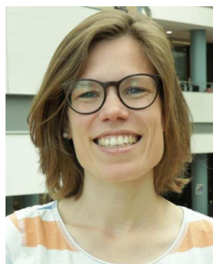
Jessi E. S. van der Hoeven

Au-Pd core-shell nanoparticles (NPs) monodisperse in size and composition were successfully synthesized via colloidal synthesis. The high angular annular dark field scanning transmission electron microscopy (HAADF-STEM) image (Fig. 1a) and size distribution (Fig. 1b) show that the Au-core Pd-shell particles have an overall diameter of 23.8 \pm 1.3 nm, consisting of a 19.7 \pm 1.7 nm Au-core and a 1.7 \pm 0.4 nm Pd-shell. The 1.7 nm Pd-shell is clearly visible in the high resolution HAADF-STEM image (Fig. 1c), which also reveals the epitaxial growth of Pd onto the Au-surface and the overall penta-twinned symmetry, as expected from the synthesis protocol. 5,13,42 The presence of the Pd-shell and the uniformity of the metal composition among the different particles was further confirmed by EDX mapping (Fig. 1d and e). The corresponding line scan in Fig. 1f clearly demonstrates a core-shell structure, where the Pd signal extends further than the Au signal. EDX quantification also revealed that the average atomic percentage of palladium was 36 \pm 5\% among nearly all particles, which is close to the 31.5