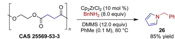
Scheme 2 Applications to polyester depolymerization. ( a Reported values are based on the theoretical amount of repeating monomer unit).

The strength of this strategy, however, lies in the ability to directly convert polyester waste to nitrogen-containing building blocks, offering a unique strategy for the repurposing of this plastic. For example, when PET was subjected to the standard depolymerization conditions without hydrolytic workup, diimine 25 was isolated in high purity in 55% yield (Scheme 2b). Further, poly(ethylene) succinate, an aliphatic polyester, underwent a novel depolymerization-cyclization sequence under similar reaction conditions (Scheme 2c). When the catalytic protocol was carried out using benzylamine, depolymerization occurred with concomitant Paal–Knorr-type cyclization to furnish pyrrole 26 in 85% isolated yield.