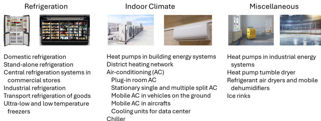
Fig. 2 Refrigerant systems and sub-uses. A technical description of all systems is provided in the ESI Section S4.†

operate with hydrofluorocarbons. 11,52 Fluorinated greenhouse gases will not be permitted anymore in new domestic refrigerators and freezers from January 2026 on, except if required to meet safety requirements. 9