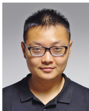
Yoanes Maria Vianney

Upon folding of a sequence composed of four closely spaced GGG triplets, guanine bases from the G-tracts will associate to form planar G-quartets (G-tetrads) through a cyclic hydrogen bond pattern involving both their Hoogsteen and Watson-Crick faces (Fig. 1). In most cases, stacking of three G-tetrads gives a three-layered G-core that is additionally stabilized through monovalent cations with a strength of stabilization in the order K^+ > Na^+ \geq NH_4^+ > Li^+ . 14 These are coordinated within the central channel of the G-core that is lined by the G-carbonyl oxygens to create a strong negative potential.