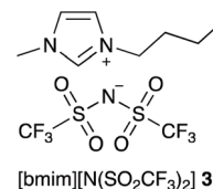
Fig. 1 The ionic liquid 1-butyl-3-methylimidazolium bis(trifluoromethanesulfonyl)imide ([bmim][N(SO 2 CF 3 ) 2 ], 3 ) used in this study. It should be noted that this anion might also be named as a secondary (sulfonyl)amide. 57 However, imide nomenclature is also reasonable 58 and serves to emphasise the two substituents, along with being consistent with previous work and what is used by the community in, for example, chemical catalogues.

This plot is generally the same shape as has been observed for some, 14,16,18 though not all, 19 related S_N1 reactions; the rate constant increases at low mole fractions of the salt 3 compared to the molecular solvent and then decreases at higher mole fractions of the salt 3 . However, it is the differences between this and previous cases that are significant. In this case, the maximum rate constant increase occurs at \chi_3 = 0.02