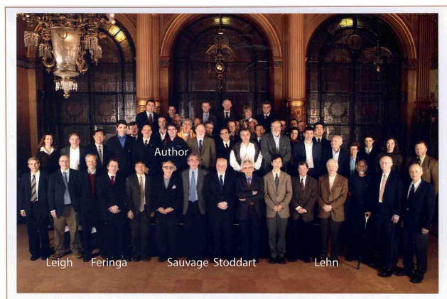
Fig. 4 Participants of the 21 st Solvay Conference on Chemistry "From Noncovalent Assemblies to Molecular Machines", Brussels, Hotel Métropole, 30 November 2007.