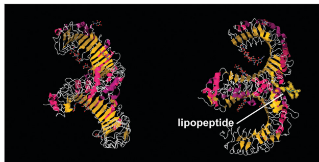
Fig. 10 Two views of X-ray crystal structure for the TLR1/TLR2 complex bound by Pam 3 CSK 4 (pdb file 2Z7X). 56 The right-hand image shows the location of the bound lipopeptide molecule (represented as yellow spheres).

Pam 3 Cys lipopeptides (Fig. 11) are synthetic versions of the N-terminal sequence of the principal lipoprotein of E. coli , also known as Braun's lipoprotein, 57 that is abundant in the cell wall of Gram-negative bacteria. 58 Pam 3 Cys-based lipopeptides are able to stimulate cytotoxic T lymphocyte (CTL) responses against influenza virus-infected cells (when linked to influenza nucleoprotein viral peptides). 59 A related lipopeptide (Pam 3 CysSerSer linked to a foot-and-mouth disease virus protein sequence) is able to stimulate antibodies against foot-and-mouth disease. 60 Pam 3 CysSerSer is able to mediate attachment to the cell membrane, internalization into the cytoplasm and to activate macrophages to secrete cytokines. 59 As shown in Fig. 10, Pam 3 CSK 4 binding leads to an m-shaped heterodimer of the TLR1 and TLR2 ectodomains, not observed for Pam 2 CSK 4 . 56