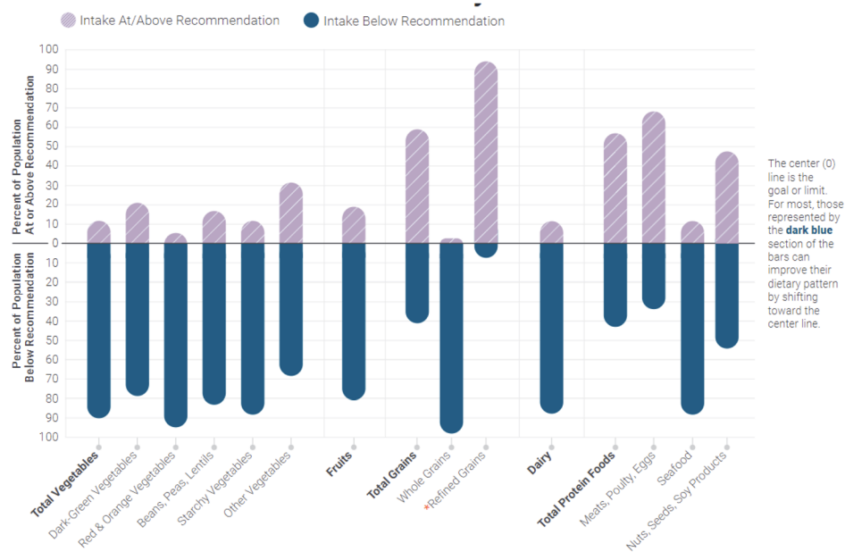
Fig. 4 Comparison of recommendation and dietary intakes of food in U.S. population ages 1 and older. Adapted from Dietary Guidelines for Americans, 1 with permission from the U.S. Department of Agriculture and U.S. Department of Health and Human Services, copyright 2020.

proteins, with exceptions such as soy, quinoa, chia seeds, hemp seeds, and buckwheat, are considered “incomplete proteins” because they are missing, or do not have enough of, one or more of the essential amino acids which makes the protein imbalanced. 9 Moreover, their variable amino acid composition, and their structural complexity, can limit their digestion. For example, the presence of anti-nutrients such as phytic acid, tannins, lectins, oxalates, saponins, protease inhibitors, and glucosinolates further complicates the digestibility and nutrient