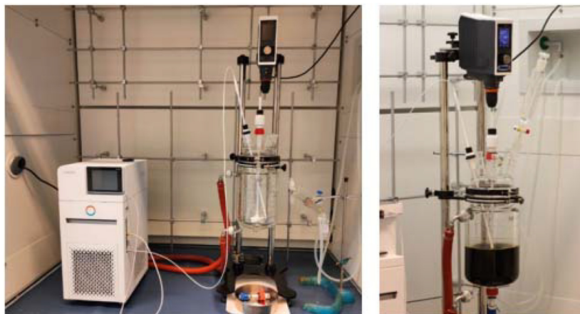
Chart 1 The 5 L stirred reactor used for the upscaled synthesis of lignin LPO.

Reaction conditions: BO/OH-L molar ratio 1, % of mol of OH in lignin per mol THF = 9, molar ratio BF 3 /OH-L 0.08, reaction temperature: r.t., addition rate (mL BO per mol OH-L per h) = 73.