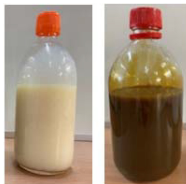
Chart 2 Reference PUD (left) and LPO-PUD (right).

The PUD were applied on wood (Chart 3) and their properties measured. The addition of LPO did not lead to significant differences in certain key performance parameters. Specifically, the comparison showed similarity in terms of tack-free time, adhesion on metal, flexibility, and impact resistance (see ESI†). It is noteworthy that both the reference PUD