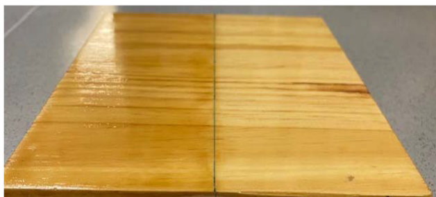
Chart 3 Application of PUD on wood. LPO-PUD (left) and PUD reference (right).

ing excellent adhesion to metal surfaces. Flexibility is a crucial property in coatings, especially in wood applications for instance. In this case, the results suggest that both the reference PUD and the PUD with LPO exhibit a similar level of flexibility, indicating that the addition of LPO did not compromise this aspect. Surprisingly, the impact resistance of both formulations was reported to be less than 5 cm, suggesting that the addition of LPO did not lead to an improvement in impact resistance.