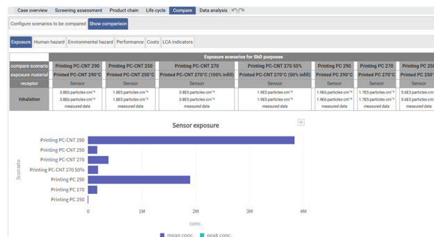
Fig. 5 Comparison of release results obtained by the air monitoring campaign performed before ( i.e. , PC-SWCNT.290) and after SbD implementations (PC-SWCNT.250, PC-SWCNT.270, and PC-SWCNT.270-50%) as well as during the production of the PC without SWCNTs ( i.e. , PC-290, PC-270, and PC-250).

Toxicological assessment. The detailed hazard assessment focused on inhalation exposure to IATA to compare the potential toxicity of the different alternatives. Information on