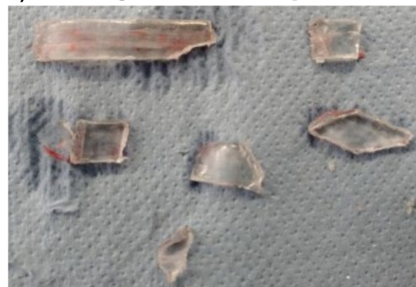
Fig. 6 Release of silver from PC by dissolution of the separation layer. (a) Shredded fragments of PC with large silver tracks on PVA layer. (b) Fragments after separation of silver by dissolution of PVA using water at ambient temperature.

segregation of PC and ink particles is sieving. Most of the ink particles were recovered as fine particles (<3 mm), while the PC particles were recovered on a 5 mm screen. Some larger ink