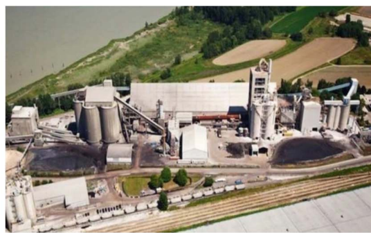
Cement -Lehigh Hanson Materials Ltd. (Delta) t CO 2 e = 873,630 in 2018 report Table 2