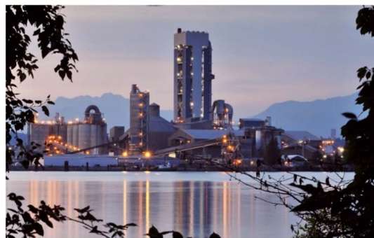
Cement -Lafarge Canada Inc. (Richmond) t CO 2 e = 658,346 in 2018 report Table2