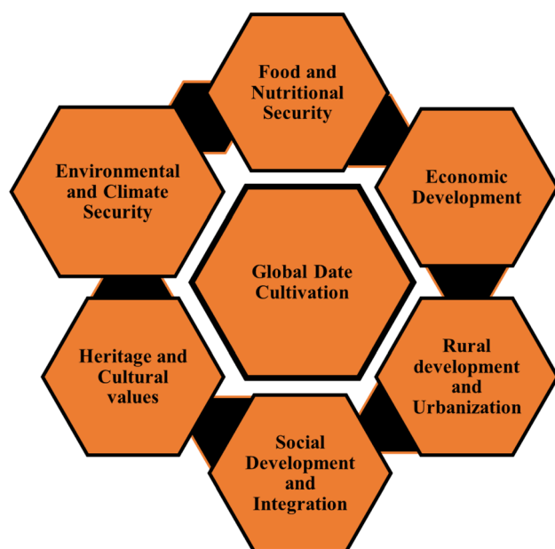
Fig. 1 Importance of global date cultivation.

Date fruits are the cornerstone of date palm products from an economic perspective, being consumed as fresh or dried whole fruits or processed into various food products, such as jams, syrups, sugars, jellies, juice, and pastes. 7,24,27 Physiologically, the date fruit is a one-seeded drupe enclosed in a fleshy