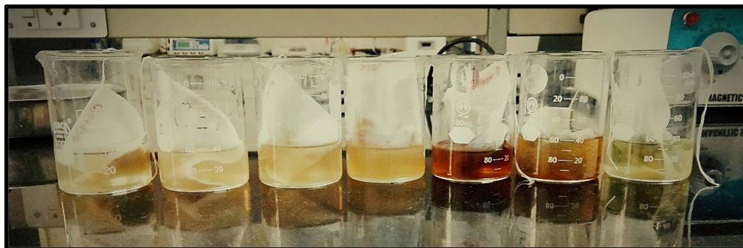
Fig. 2 Formulated herbal infusions along with market samples (sample sequence from left starts with A-91, B-73, C-64, D-55, Brand-A, Brand-B, Brand-C).

The data reported are average of triplicate readings and otherwise stated. The data given in tables were subjected to one-way