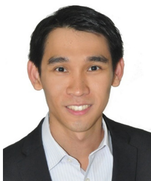
Zhi Wei Seh

In this review, we first discuss the key properties of the most common electrode and electrolyte materials. Then, we summarize recent progress on battery materials advancement using ML techniques, through three ML strategies: (1) direct property