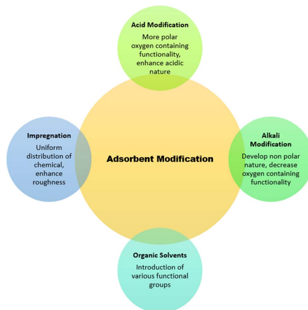
Fig. 4 Types of modification methods of adsorbents and their effects on properties.

The performance and efficacy of an adsorbent are characterized by factors, such as (a) large surface area, (b) high penetrability with small-sized pores, (c) thermal and chemical stability, and (d) good mechanical strength. 119 All these factors play positively towards the efficiency of adsorbents. Certain surface modification techniques are also in practice related to the enhancement of the adsorption capacity of adsorbent materials that revise the physical, biological, and chemical behaviors of substances (Fig. 4). 120 Adsorbent characteristics get enhanced by modifying the surface charge, roughness, surface area, and porosity, and these modifications are carried out by thermal, chemical, or mechanical procedures. Physical modification treatments favor enhancing the porosity, density, and solubility, while chemical treatments (involving alkali, acid, salt etc.) help in increasing the surface area. 121,122 Among the physical and chemical modification techniques, chemical treatment gives better results, as it directly influences the surface of adsorbents and not time-consuming along with some additional surface