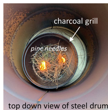
Fig. 1 (A) Sampling and wildfire locations, and the smoke plumes and wildfire hotspots from the Silverado Fire (on October 26, 2020) as viewed by the Moderate Resolution Imaging Spectroradiometer (MODIS). Laboratory combustion experiments with (B) pyrolysis and (C) flaming combustion of pine needles.

formation, and OP-DTT measurements were performed on these filter and blank samples following the procedures in our previous study. 52 EPFR measurements were conducted within 8 months of sample collection and ROS and DTT measurements were conducted within 8–18 months. Gehling and Dellinger (2013) 56 showed that a semiquinones-type radical has a half-life of 208 to 417 days and Sigmund et al. (2021) 53 revealed that EPFRs in wildfire charcoals can remain stable for years. In our previous work, we found that EPFRs in PM_{2.5} samples collected at the same highway sites are stable at least a year after collection. 52 Some fraction of EPFRs are reported to have a shorter lifetime with days at room temperature, 56 so the EPFRs measured in this study likely do not include those with fast decay; hence, the reported EPFR concentrations in this study should be regarded as a lower limit. ROS and DTT measurements should not be impacted significantly by the filter storage, as the generation of ROS or the reaction with DTT occurs only upon filter extraction of stable PM compounds, respectively. The data are presented as per the volume of air sampled ( pmol