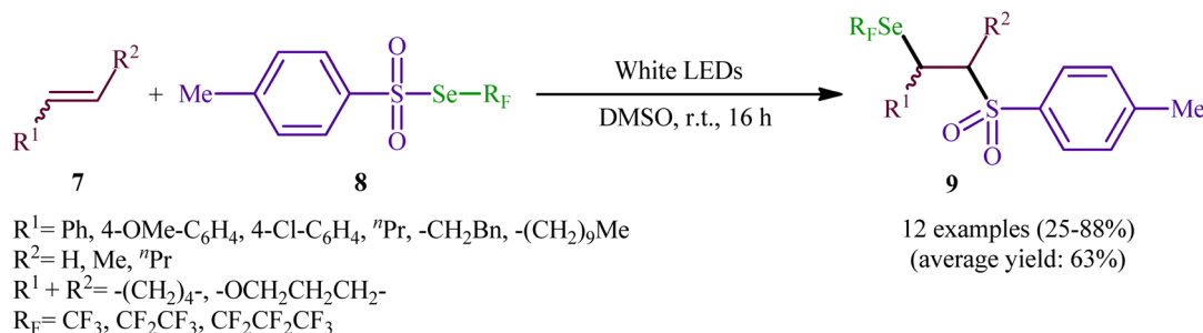
Scheme 4 Visible-light promoted fluoroalkylselenenolation of alkenes 7 with fluoroalkylselenotoluenesulfonates 8 .

Near two decades later, the same authors reported their results on the visible-light promoted fluoroalkylselenenolation of various terminal and internal alkenes 7 with fluoroalkylselenotoluenesulfonates 8 (Scheme 4). 30 Optimal conditions for this photoreaction were the use of white LEDs as the light source, and DMSO as the solvent. The reaction proceeded cleanly at room temperature and the desired \beta -fluoroalkylselenolated sulfones 9 were obtained in fair to high yields within 16 h. In the case of both terminal and internal aromatic alkenes, the reaction exhibited a high degree of regioselectivity, in which the selenyl groups are predominantly