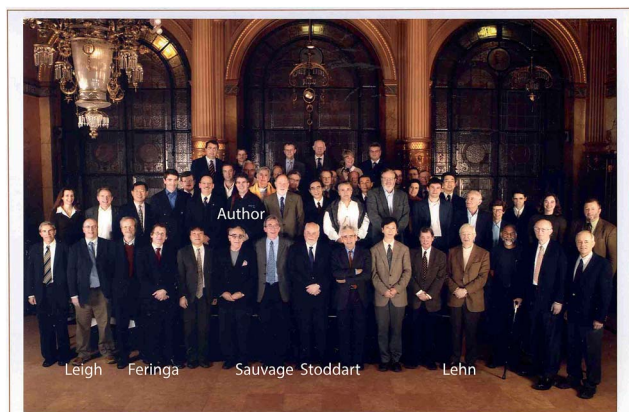
Fig. 4 Participants of the 21 st Solvay Conference on Chemistry "From Noncovalent Assemblies to Molecular Machines", Brussels, Hotel Métropole, 30 November 2007.