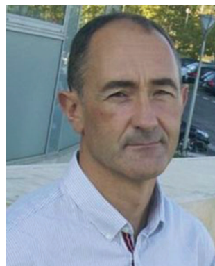
Luis M. Liz-Marzán

The majority of chiral systems synthesized and probed in the laboratory till 1998 were based on organic molecules. 10,18