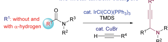
Scheme 1 (a) Nagashima's catalytic reduction of amides to enamines and (b) bis-metal sequential catalytic transformation of amides with C–C bond formation.

b. This work: Reductive alkylation of tert -amides by bis-metal tandem catalysis