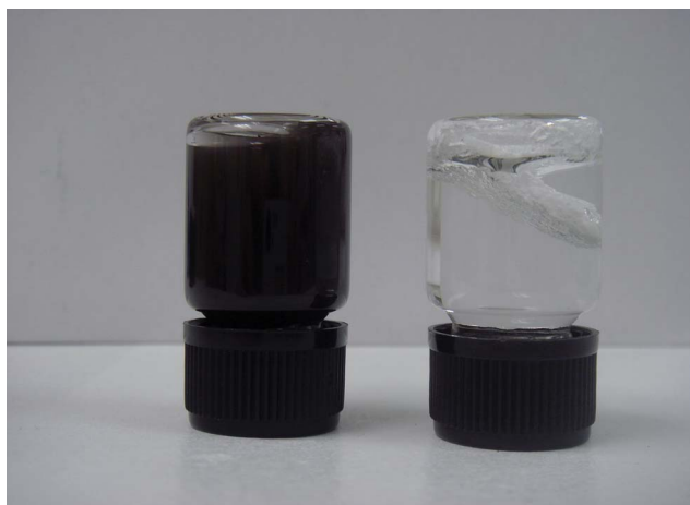
Fig. 1 Photographs of vials containing the pristine BNNTs (right-hand side) and the functionalized BNNTs (left-hand side) in water after standing overnight.

description in the ESI†). To confirm the functionalization and reveal the functionalization mechanism of BNNTs with dopamine, FTIR analysis was conducted on the pristine and functionalized BNNTs.