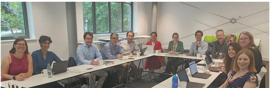
Fig. 1 2009 Polymer Chemistry Editorial Board meeting (top) and 2024 Polymer Chemistry Editorial Board meeting (bottom).