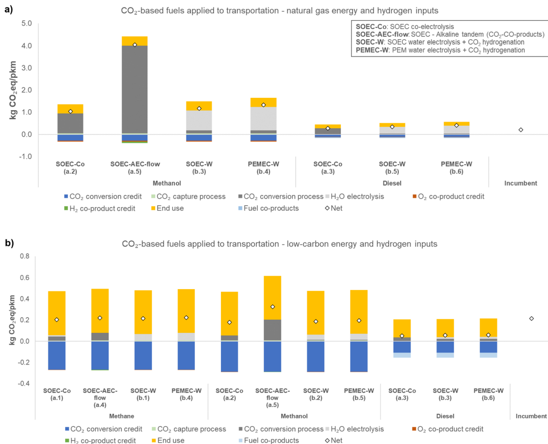
Fig. 3 Life cycle GHG emissions of transportation, with (a) natural gas-based and (b) low-carbon-based energy inputs, in kg CO 2 eq per pkm, for electrochemical and hybrid pathways. White diamonds represent the net GHG emissions which are the GHG emitted minus the CO 2 converted and the credits. x-Axis: SOEC-Co: SOEC co-electrolysis, SOEC-AEC-flow: CO 2 conversion in SOEC followed by AEC, SOEC-W: SOEC water electrolysis followed by CO 2 hydrogenation, PEMEC-W: PEMEC water electrolysis followed by CO 2 hydrogenation. Incumbent: conventional way to produce or generate a service. Pkm: passenger-kilometer. Note the y-axis scale difference between (a) and (b).

The hybrid pathway (SOEC-W, case b.2) also requires energy for separation, but this strategy has the advantage of heat integration within the system. The methanol synthesis process is exothermic, which allows the heat generated to be used in the distillation process, 73 reducing the external energy input. Regarding the AEC-flow, improvements in the electrochemical process itself ( e.g. , faster kinetics, improved stability, and higher selectivity) 22 and integration with other industrial processes that generate surplus heat that can be reused in liquid products separation may help the process become more competitive in terms of GHG emissions.