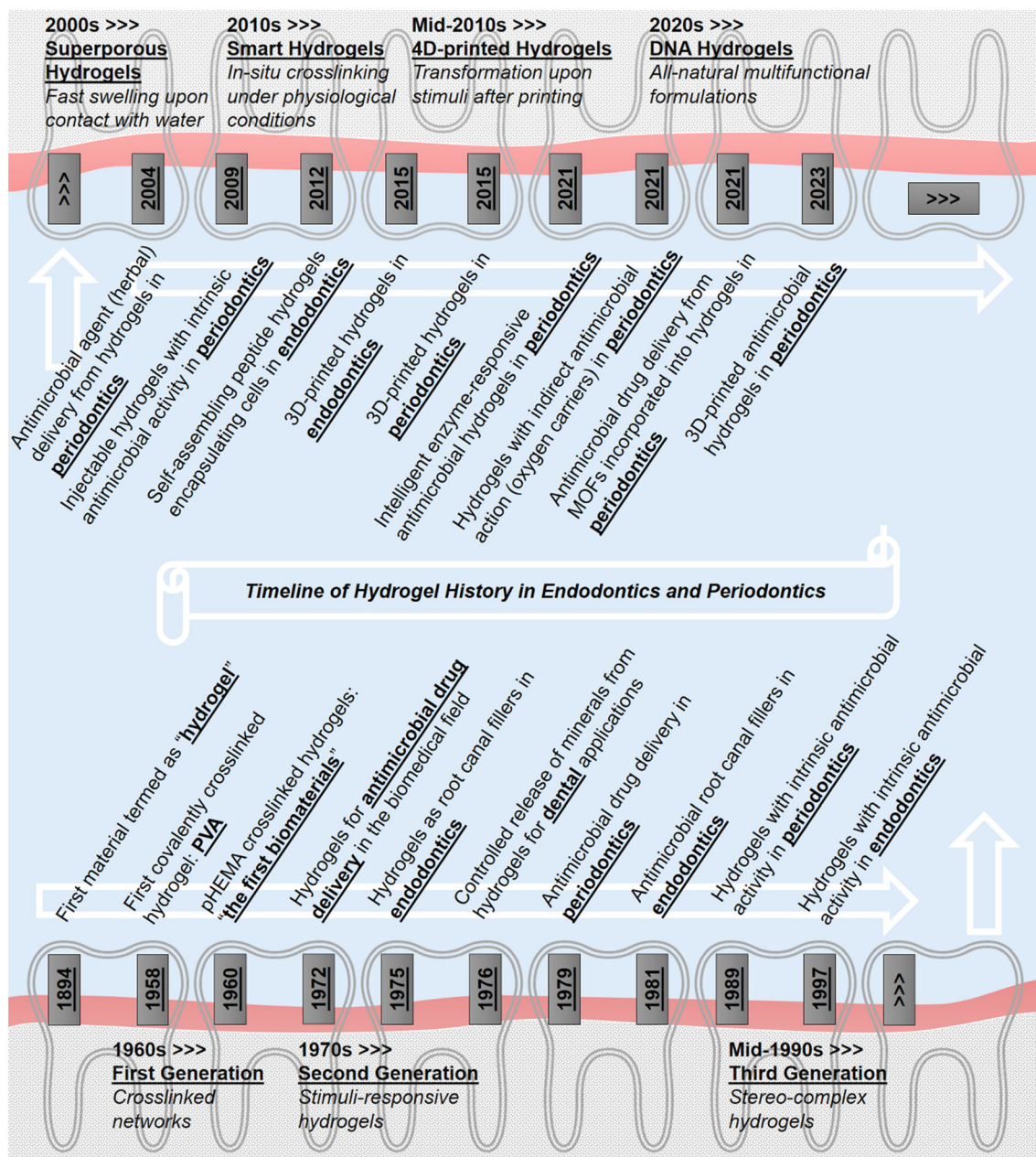
Fig. 2 Schematic of chronological history of antimicrobial hydrogels in the scope of endodontics and periodontics.

manner have been reviewed for the first time. The antimicrobial efficacy of the novel hydrogels concerning specific pathogens is compared together with their biocompatibility level for the host cells. Inherently antimicrobial hydrogels composed of peptides and/or polymers as well as hydrogels combined with the addition of antimicrobial drugs/particles are classified. The key findings concerning the state-of-the-art of antimicrobial hydrogels are discussed. Finally, challenges and prospects are highlighted including dextrous biomaterials (e.g., DNA) and advanced fabrication techniques (e.g., 4D printing). During the study selection process, the first criteria set was whether the antimicrobial hydrogels were formulated to