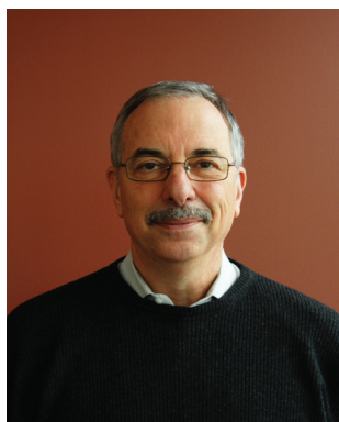
Bruce R. Zetter

Protamine is a natural cationic protein, which gives it an excellent ability to complex nucleic acid including mRNA (Fig. 3a)